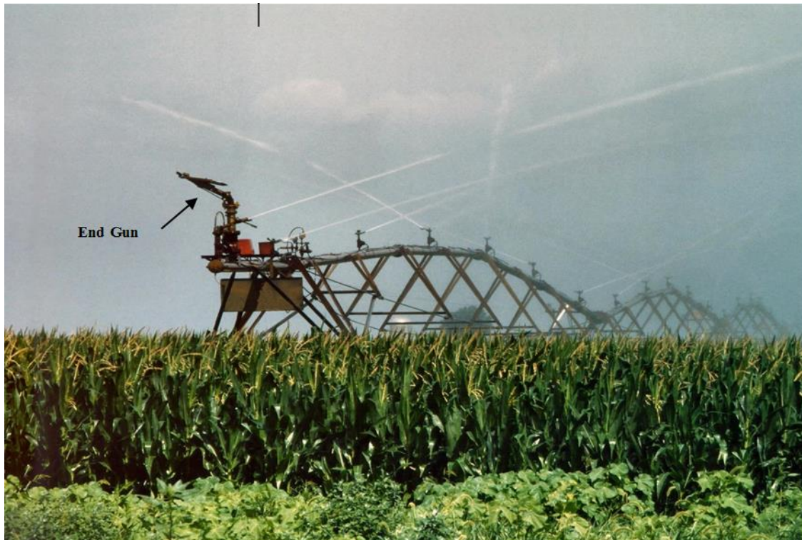
Figure 1 – A high pressure center pivot irrigation system with sprinklers on top.