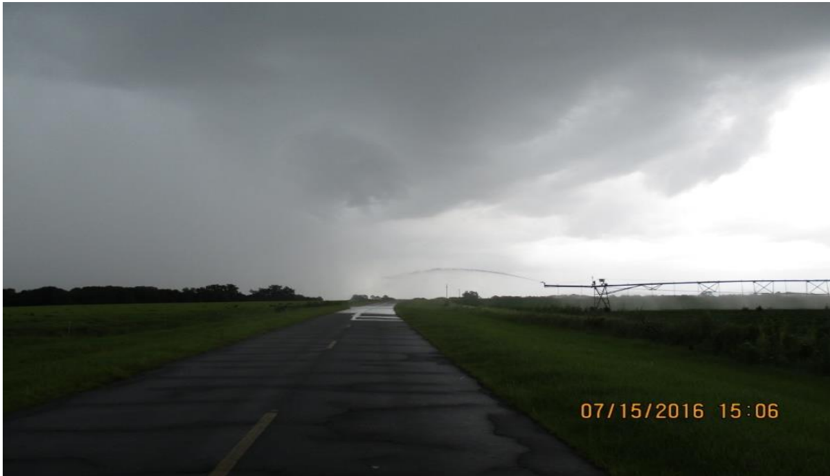
Figure 3 – A center-pivot system in Georgia’s ACF Basin irrigating during a rain storm and an end-gun spraying the road.

drop nozzles can be easily dragged through the canopy. A 95% or greater application efficiencies can be achieved by this method.