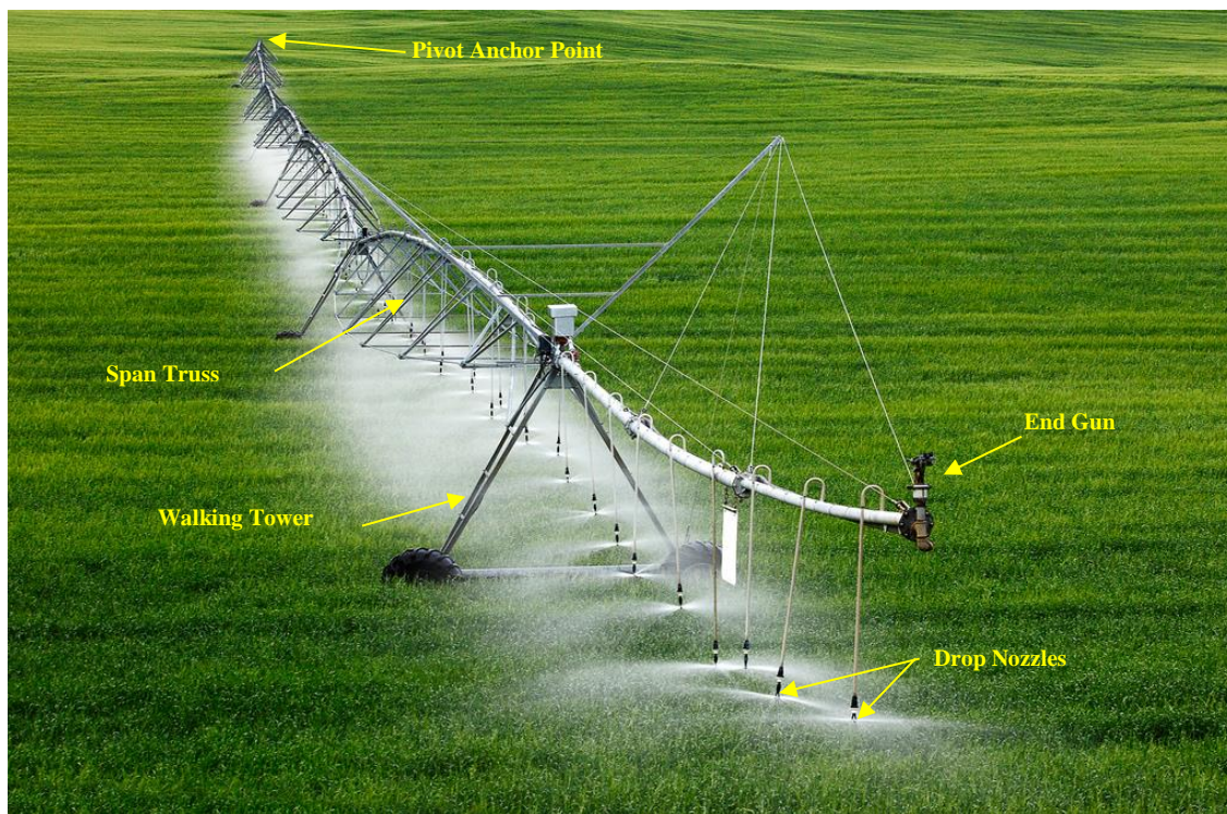
Figure 2 – A low pressure center pivot irrigation system with drop nozzles.